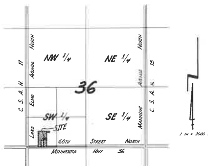
VICINITY MAP SECTION 36, T30N - R21W CITY OF GRANT WASHINGTON COUNTY, MINNESOTA