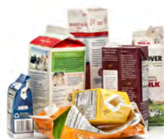
Dairy & Juice Cartons