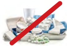
Foam Cups & Containers