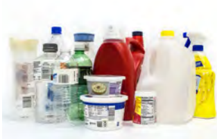
Plastic Bottles & Containers 1-7