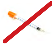
Sharps & Medical Waste